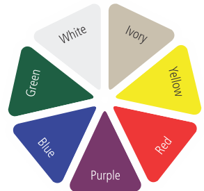
Available in 7 light diffused 3116" acrylic colors